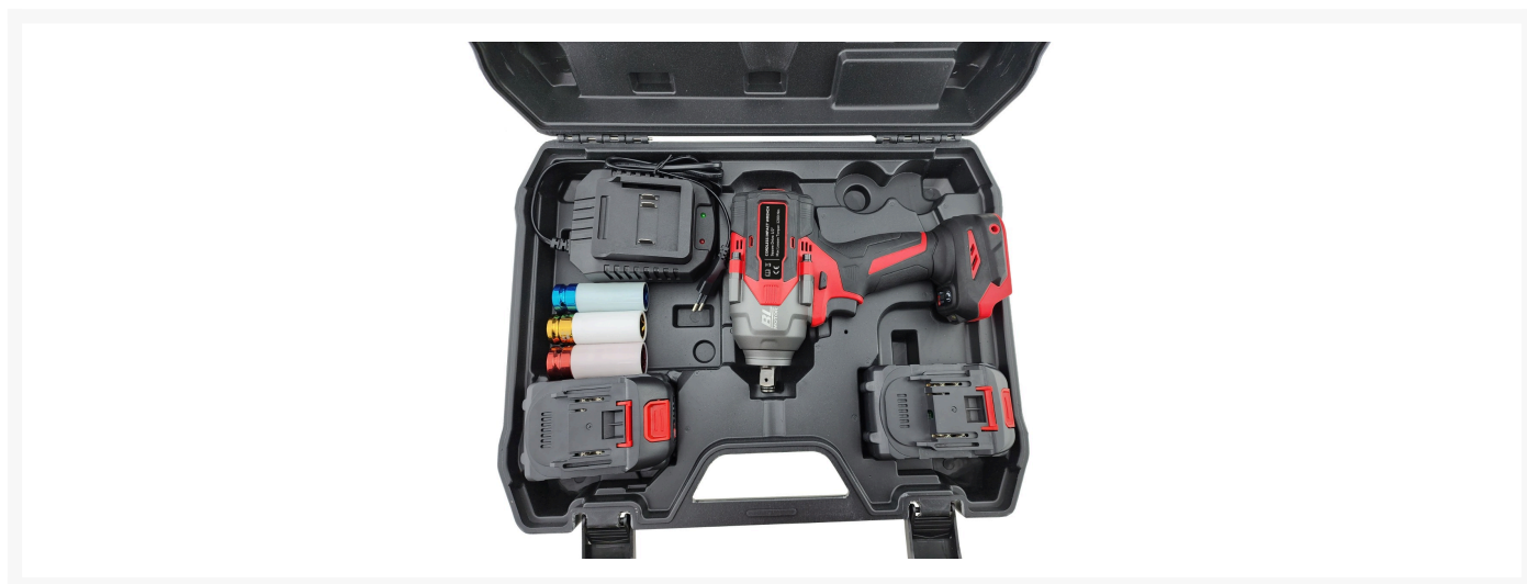
1/2" A63 cordless impact wrench - set in a case.